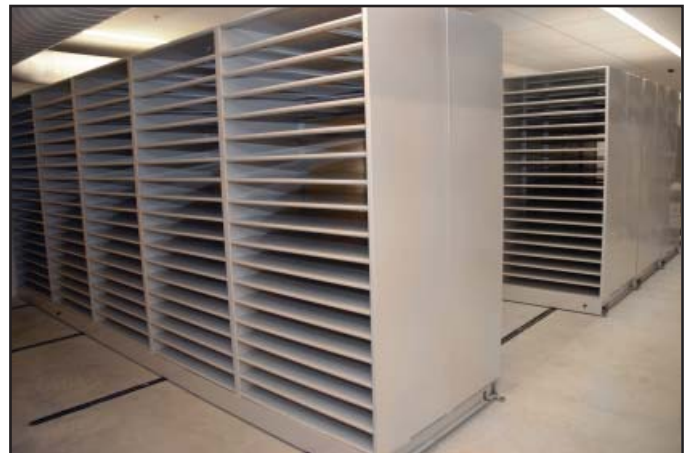
Atlas shelving - 2009