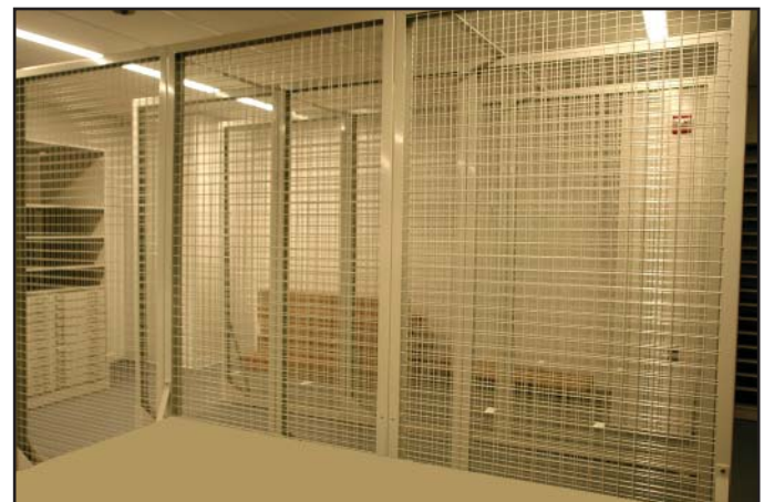
Art racks to store framed maps - 2009