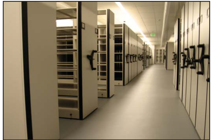
Compact shelving units installed - 2009