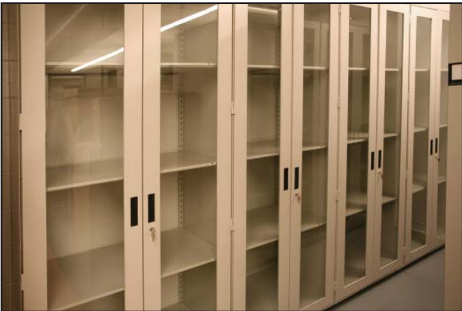
Globe cases - 2009