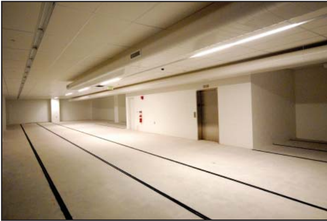
Storage room - 2008

A new two-story vault, measuring 7,750 square feet, will house the growing cartographic collections. The custom designed storage systems for atlases, globes, maps, and scientific instruments were purchased from Systematics, Inc. with a $466,000 Grant for Stabilizing Humanities Collections from the National Endowment for the Humanities, Division of Preservation and Access. In January 2009, some 80,000 pounds of compact steel shelving and flat files were installed on rails as shown below.