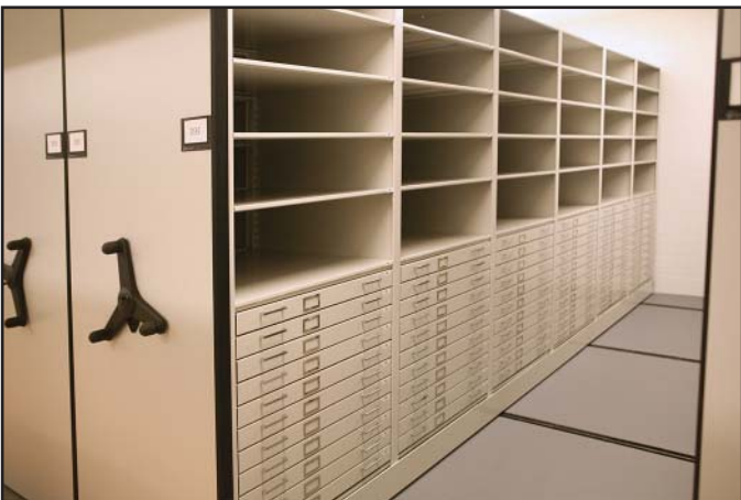
Compact flat files with atlas shelving - 2009