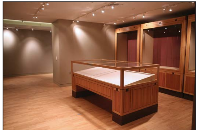
Exhibition room 2009