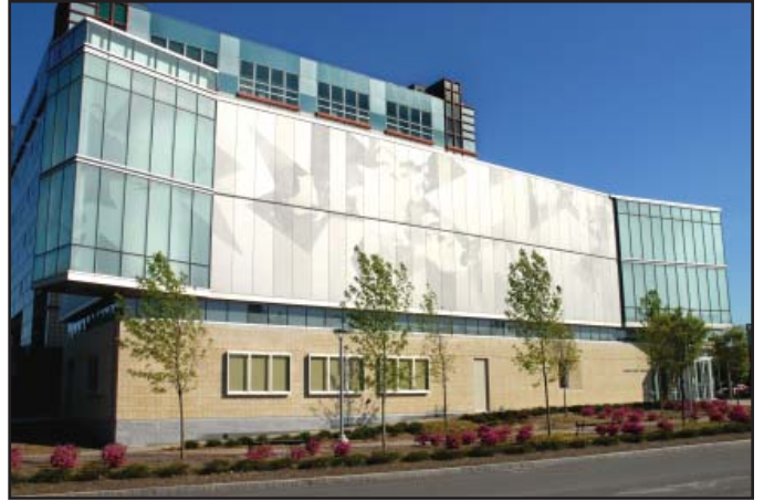
May 2009 - Bedford St.