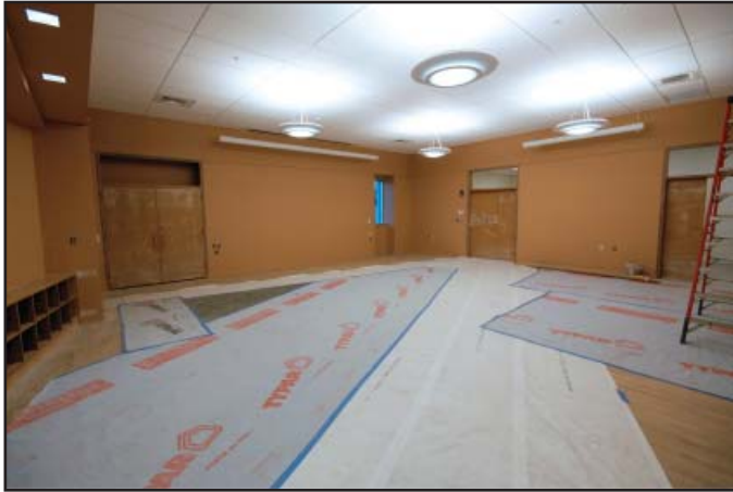
Cohen Education Center 2008