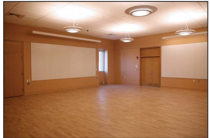
Cohen Education Center 2009