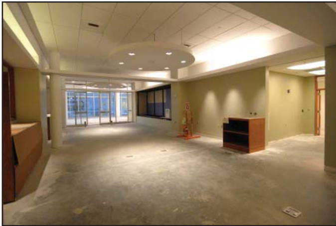
Reference Room 2008