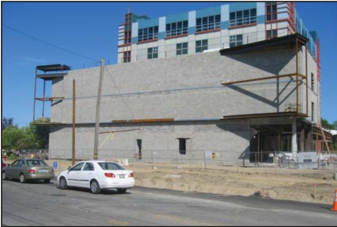
June 2008 - Bedford St.