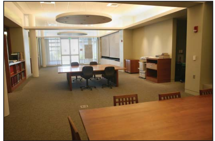
Reference Room 2009